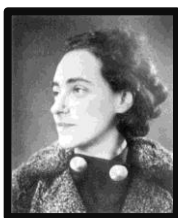
Czech-American number theorist Olga Taussky-Todd died on this FAMUS day in 1995.

"While I tried to read any books that came my way, the realization that great wisdom was not gained by reading books struck me suddenly. I felt scientific experiments provided almost unlimited insight ... Mathematics, too, came to me at that time as an experimental subject ... Gradually it became clear to me that [math] was my subject." - a quote from Olga Taussky-Todd